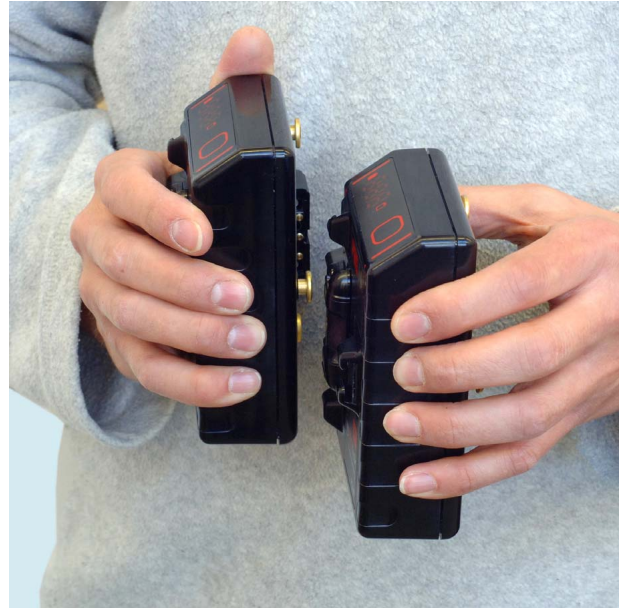
Linking two PL94T batteries produces a capacity of 188Wh, three give you 282Wh.

PAGlink also allows batteries to be hot-swapped for continuous power, which means no more time-wasting camera reboots while shooting. Intelligent PAGlink batteries form a network when linked, allowing them to communicate with each other and manage output safely and efficiently. The batteries do not discharge into one another.