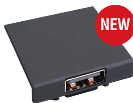
USB (5V, 2A) Model 9709U Replaces the 1A version pre-August 2019