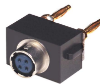
Hirose (4-pin) Model 9709H