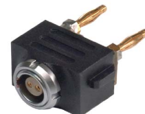
Lemo (2-pin) Model 9709L