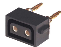
D-Tap Model 9709D

© PAG Ltd. PAG is the trademark of PAG Ltd. / PAG reserves the right to change the specifications contained herein without notice.