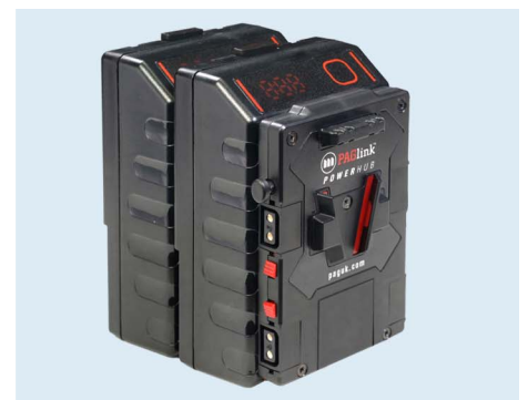
Use the PowerHub on the rear battery so that an accessory holder can be mounted to its face.