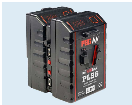
Sandwich the PowerHub between batteries to maintain the PAGlink system's hot-swap feature.