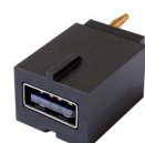
USB-A (2A) PAG-9712U