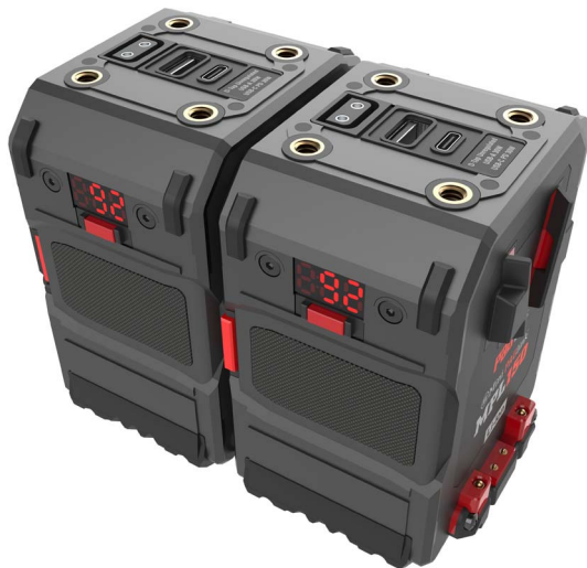
Linking two MPL150 doubles the capacity to 300Wh.