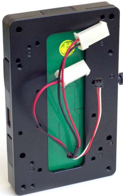
FIXING POSITIONS OF BACKPLATE SUPPLIED WITH MOUNT